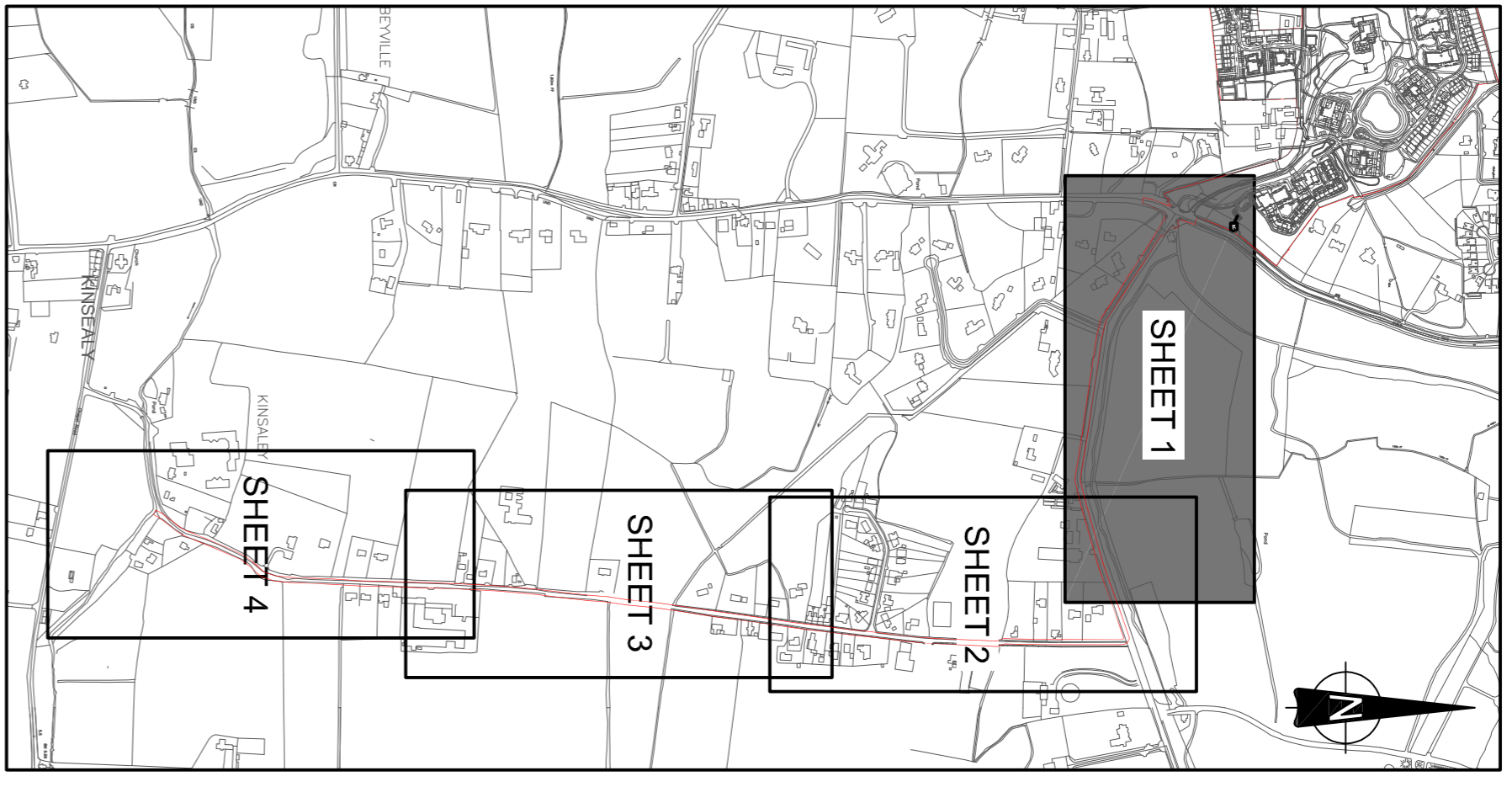
KEY PLAN SCALE 1:10000